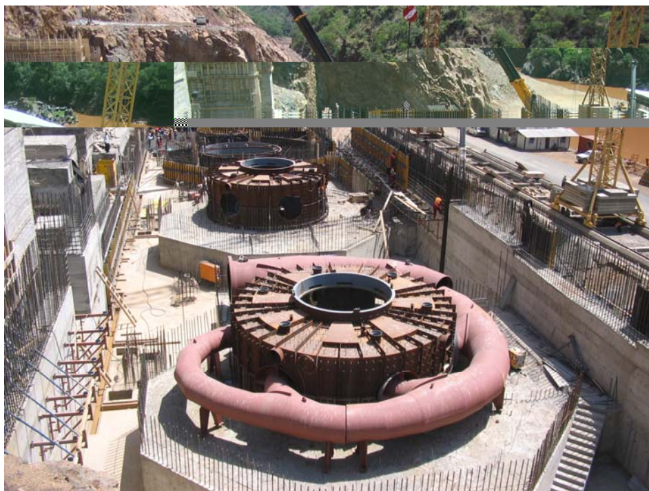
Fig.4. The Gibe II power house, under construction.

The selection of the general layout of the two cascade plants scheme has been governed by a number of technical and economic considerations, and was substantially influenced by the geological conditions of the area.