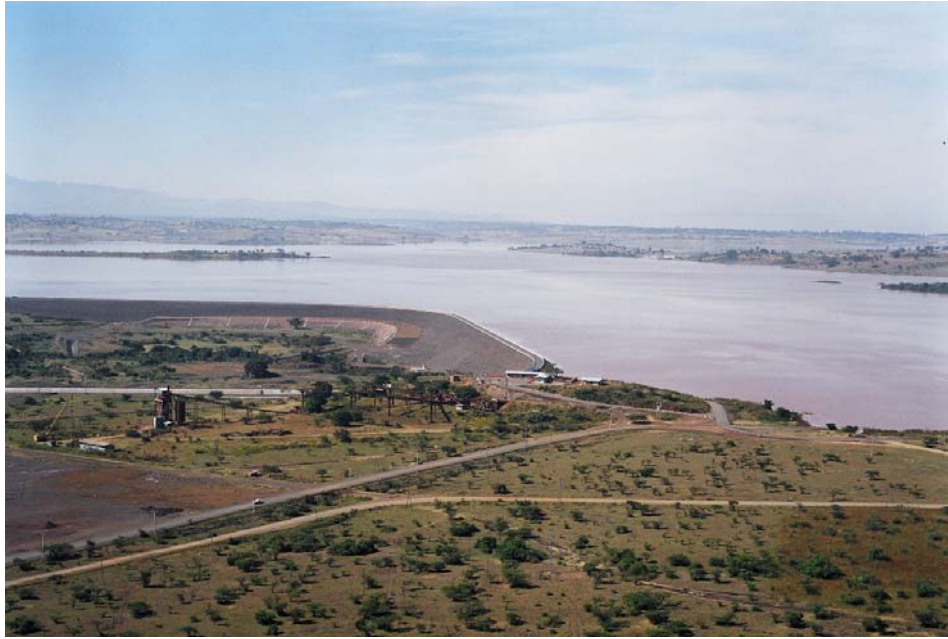
Fig.2. The Gibe I dam on the Gilgel Gibe river.